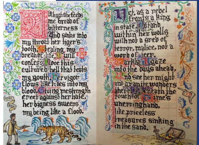
Medieval-style manuscript page by Katherine Fralix.