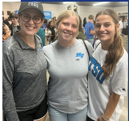
Students from the True Blue Tour in Shelbyville, TN.